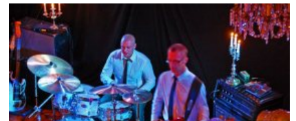
Amazing Blue Gurus – Wish U Well